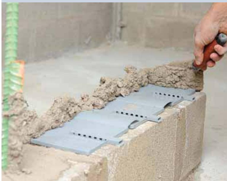
Correcting Kahn’s flashing omission with hidden 2010 technology, one of Cavalieri’s masons grouts the flashing system into place.

slap-dash fashion (“as if it had been applied straight from the tube,” quipped Inga Saffron), was crumbling.